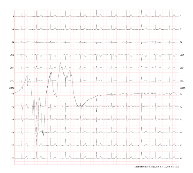
Figure 1. An Indeterminate ECG. Most of those who graded it gave it a C or better, but one gave it an F. Cases such as this one were not used to calculate scores in any Challenge event.

The letter grades were assigned these numerical values: A = 0.95, B = 0.85, C = 0.75, D = 0.6 and F = 0. For each ECG, we calculated the average of all grades, and gave it a reference quality classification of Acceptable (if two or more grades were available, the average grade \geq 0.7 , and no more than one grade was F), Unacceptable (if two or more grades were available, and the average grade < 0.7), or Indeterminate (otherwise; see figure 1).